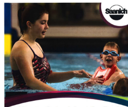
How to Get a Job at the Pool

Gordon Head Recreation wants you to know that they are actively looking for aquatic staff. If you want to learn how to become a lifeguard or an aquatics instructor, be sure to pick up their brochure in the Career Center. Jobs at the pool are well paying and offer a flexible schedule.