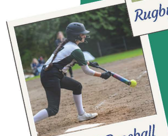
Softball & Baseball