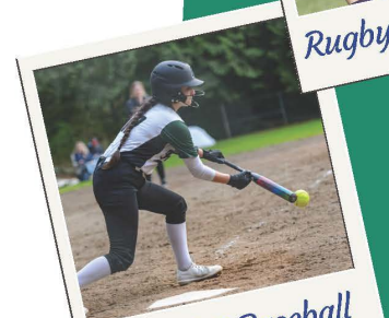
Softball & Baseball